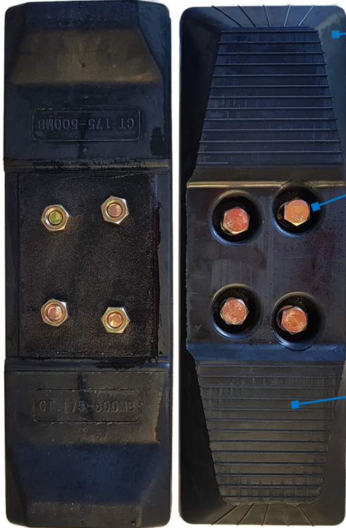
(Nuts and bolts included)

DEKK Chain On rubber pads have been designed and manufactured to be easily chained directly onto the track chain on excavators, skid steers and crawler carrier machines to help alleviate surface damage caused by steel tracks and improve overall performance. The core features and benefits of our Chain On rubber pads include: